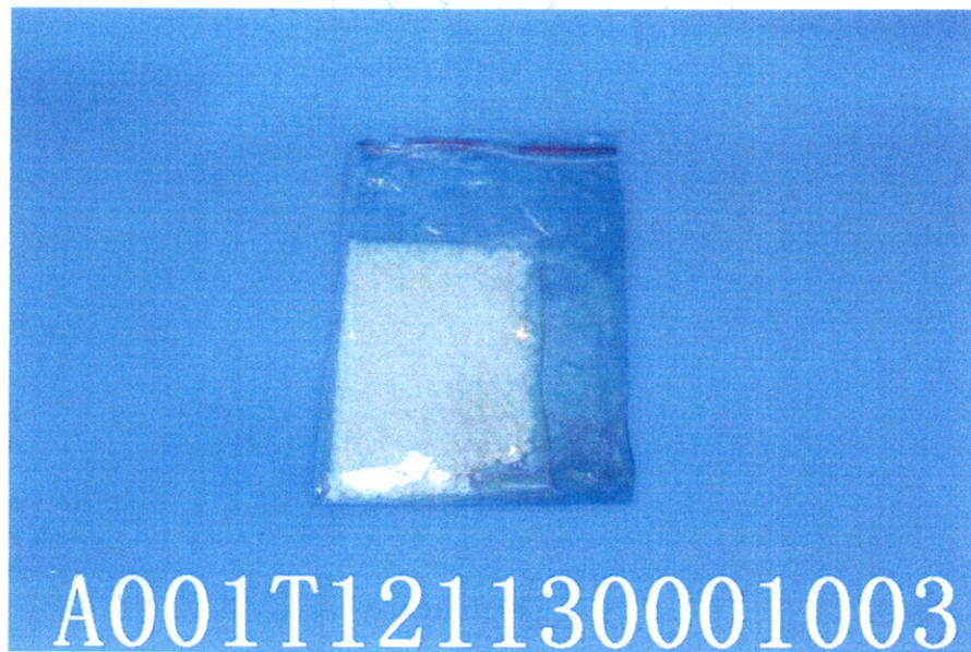
Sugar free mint